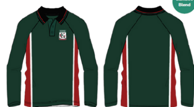
LONG SLEEVE POLO WORN BY PREP - GRADE 5