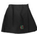
BLACK SKIRT - COTTON