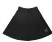
BLACK WRAP SKIRT - COTTON