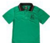
GREEN POLO - POLYESTER