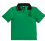
GREEN POLO - POLY/COTTON