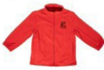
RED POLAR FLEECE