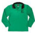
GREEN LONG SLEEVE POLO