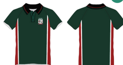
POLO WORN BY PREP - GRADE 5