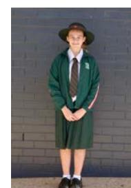
Blouse with College jacket