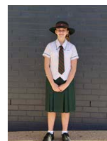
Blouse with skirt