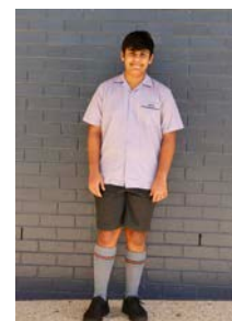
Grey hemmed shirt, shorts