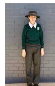
Blouse and grey trouser option