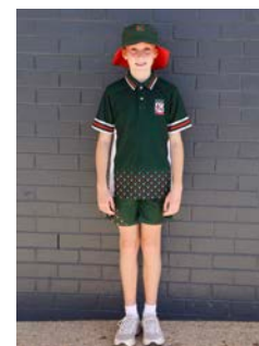
Sports uniform with bucket hat