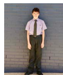
Tie and grey trouser option