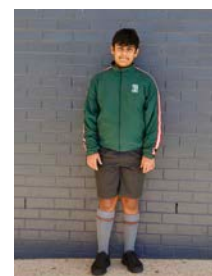
With College jacket option