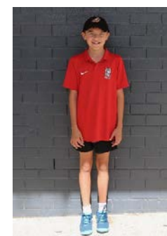
Sports Excellence uniform with cap